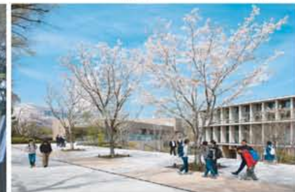
栄光の道の新しい3本の桜 New Cherry Blossom ('16.04 井田 宗秀)