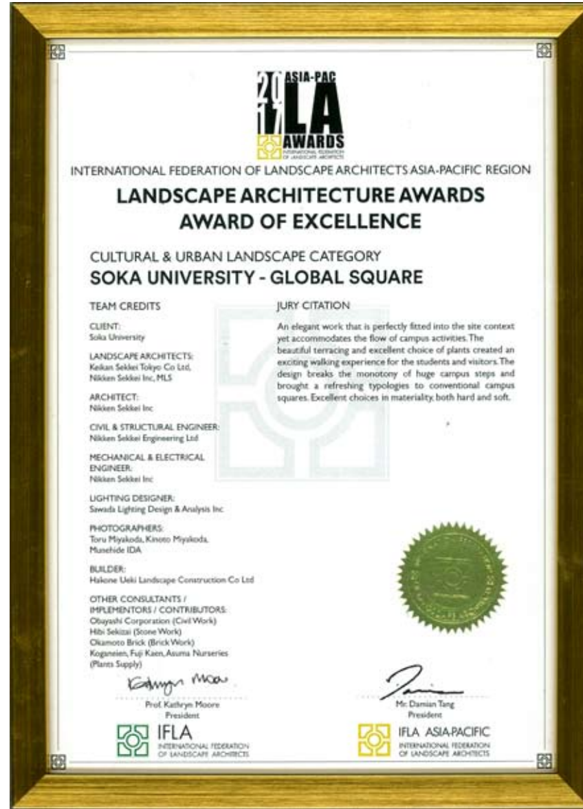
賞状 Certificate of Award of Excellence