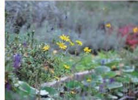
ロマンの庭 Romantic Garden ('14.06 都田 乙)