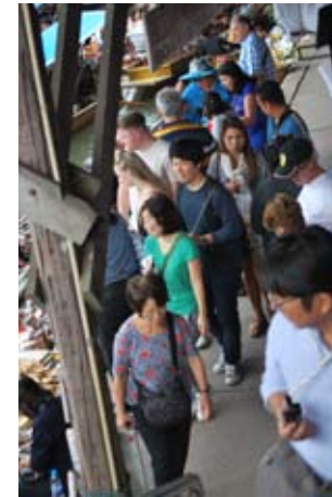
タイの水上市場は依然と活発に残っている Water Market continues to remain active in Thai