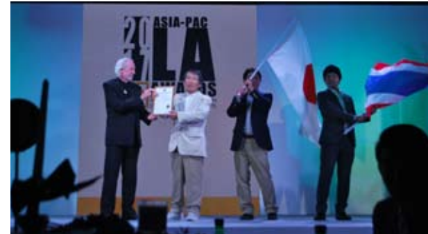
日本の旗とタイの旗を振って国際交流 International Exchange with the Japan and Thai National Flags