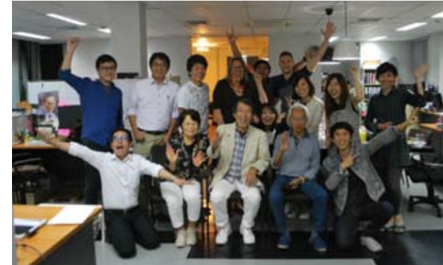
タイ No.1 のランドスケープ事務所とのコラボレーション Collaboration with No. 1 Thai landscape design firm