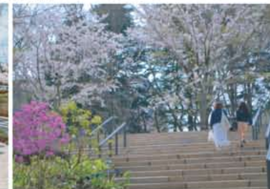
サンクン広場の春 Cherry Blossom & Azaleas ('16.04 都田 徹)