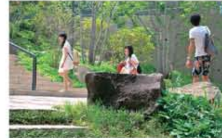
サンクン広場の景石 Stone Boulder ('14.06 都田 徹)