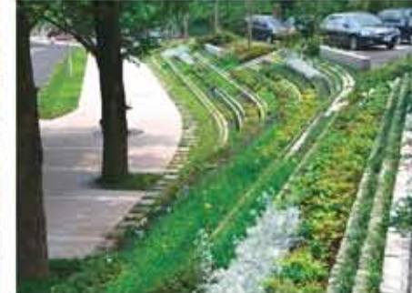
ロマンの庭 Romantic Garden ('14.06 都田 乙)