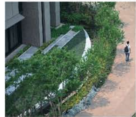
三日月の庭 Crescent Garden ('14.06 都田 乙)

Environment of the University Campus The design goal is to create an innovative environment continuously transforming in accordance with its seasonal changes as well as establishing a special iconic landscape in order to revitalize a campus environment. Students spend the most of their life on the University Campus. Campus should provide not only academic functions but also vital place such as a town.