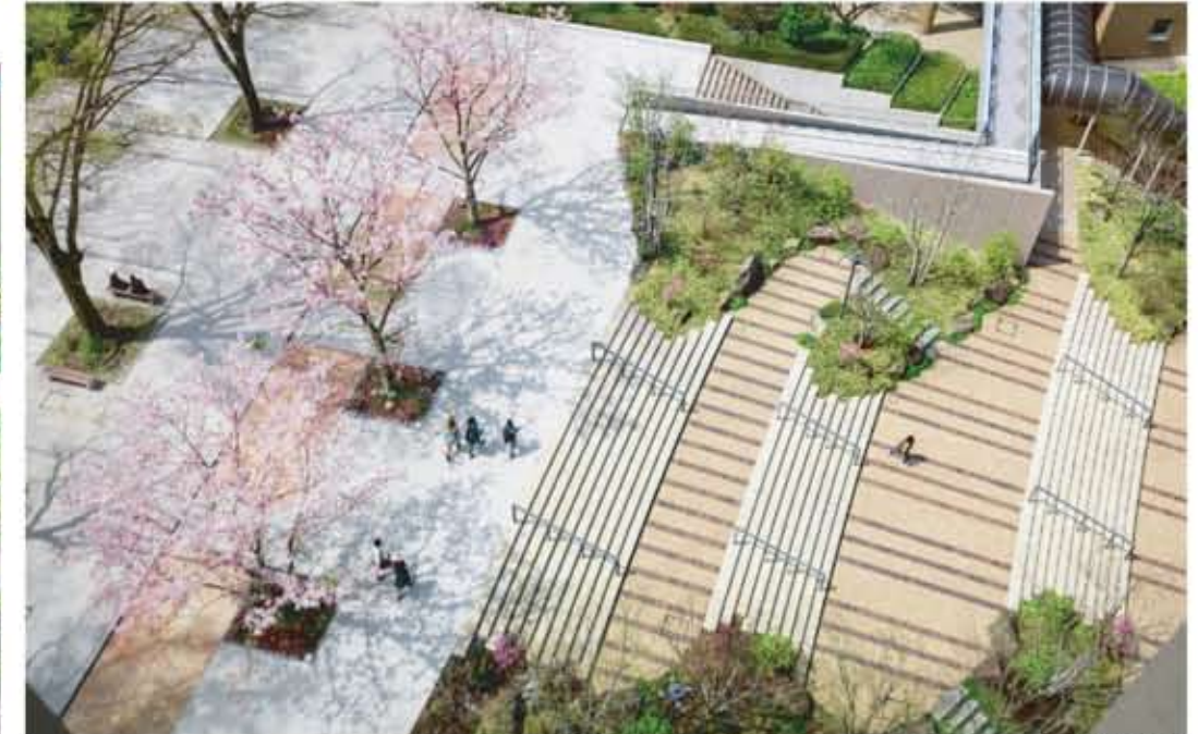
ホール前サンクン広場 Stepped Sunken Garden ('16.04 井田 宗秀)