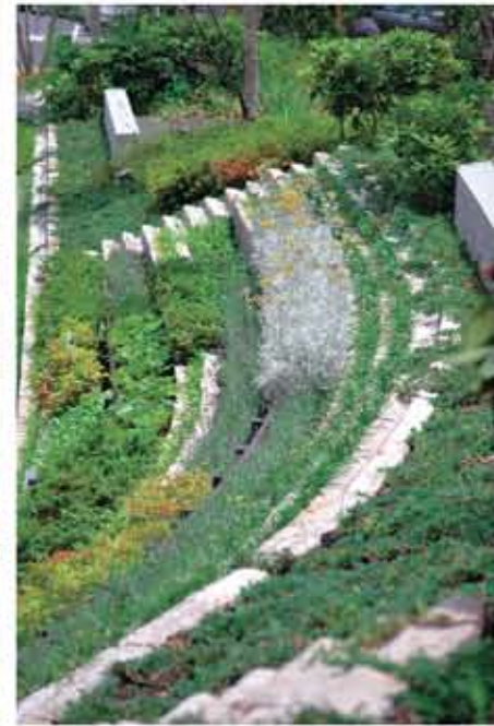
ロマンの庭 Romantic Garden ('14.07 都田 乙)