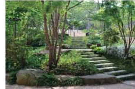
サンクン広場の石階段 Stone Steps