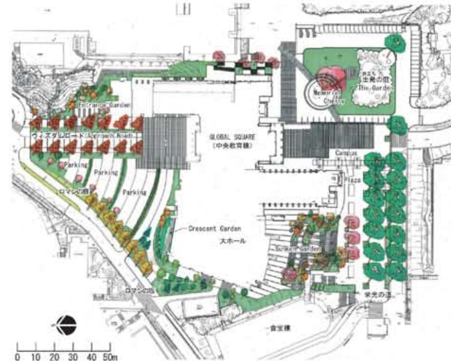
中央教育棟ランドスケープアイソメ図 GLOBAL SQUARE Isometric Plan