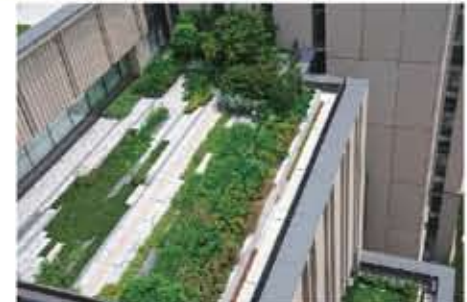
天空の庭(7F) Sky Garden ('14.06 都田 乙)