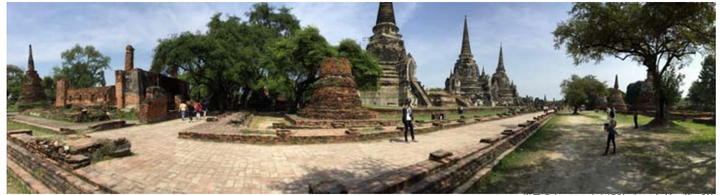
世界遺産のアユタヤ遺跡 (400年前の夢の跡) Ayutthaya World Heritage (Traces of a dream 400 years ago)

アジア全体では60~70社が受賞し、日本からのAward受賞は当社と日建設計、高野ランドスケープの3社のみでした。