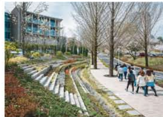
ロマンの庭の春 Romantic Garden in Spring ('16.04 井田 宗秀)

The scope of this new landscape design is large, which covers ① Main Promenade of the main circulation on the University Campus, ② Approach to the North Entrance and "Romantic Garden" including parking lot and slope, ③ Stepped Sunken Garden on the south of University Auditorium, ④ Crescent Garden (backdrop of the University Auditorium), ⑤ Roof Garden on the 7th floor. The other landscape design includes access to the students lounge and roof gardens on 3rd and 4th floor.