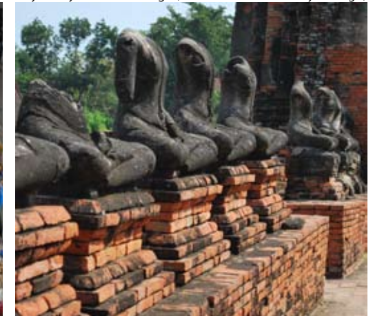
往時を想うと哀しい像 Sorrowful Statue showing some traces of the past